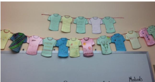
Figure 5. “Sense of Hope” T-shirts.

Because the management at BCAC support and were able to operationalize the Organizational Resiliency Model, staff took on the tasks of planning agency-wide activities that reinforced the resiliency elements. As the program evolved, BCAC was no longer doing vicarious trauma training, but rather, they were implementing a resiliency program. This shift in thinking promoted creativity, and additional activities were developed to reinforce the five elements. Today, the elements of resiliency are incorporated in monthly all-staff meetings and in new programs for BCAC staff.