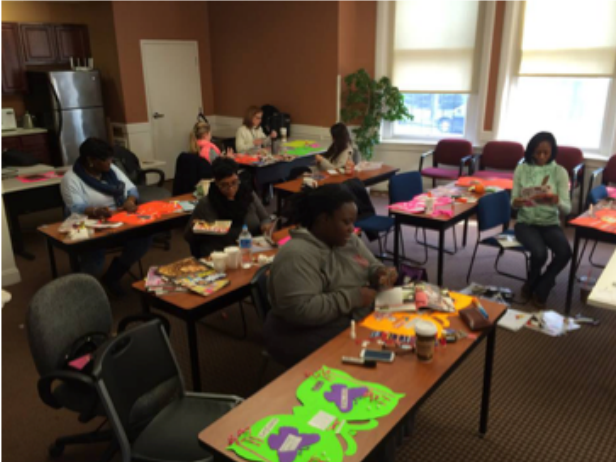
Figure 4. A “Butterfly Vision Board” on which staff members paste images of how it looks when BCAC achieves its mission.

During one meeting, staff members were asked to think about what makes them engage in the work, why they came to this field, and what keeps them there. They were then given journals and asked to write three positive things every day.