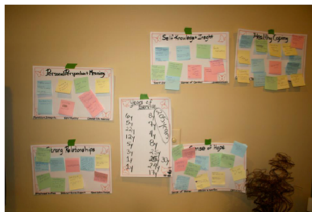
Figure 2. A board in the kitchen explains each element and suggests appropriate activities.

mornings, allowing time for staff to attend meetings or trainings or to catch up on their work before the weekend. Cook-offs focus on different food groups and allow staff to taste and savor a variety of healthy foods. Zumba®-type classes help staff blow off steam through strenuous (but fun) exercise.