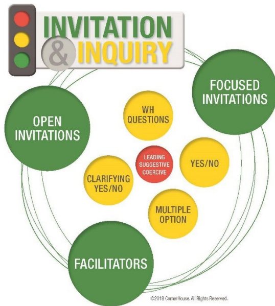
Figure 3. Invitation and Inquiry

drawing upon what is most salient to them or best remembered. Invitations can elicit information which is more likely to be accurate (APSAC Taskforce, 2012; Newlin et al. 2015), and they provide minimal parameters or direction from the forensic interviewer.